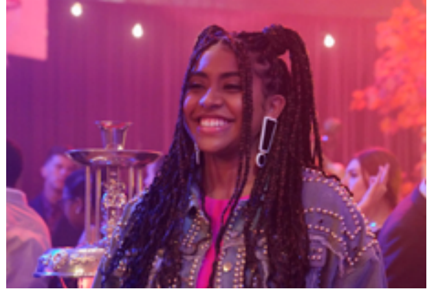
Alycia Pascual-Peña in SAVED BY THE BELL