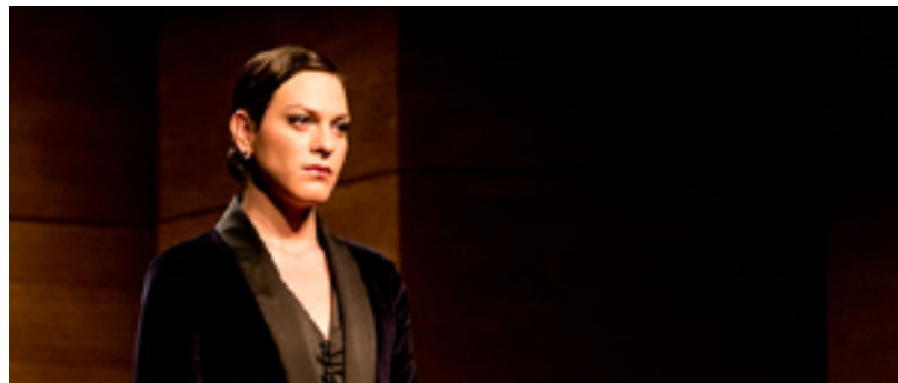
Daniela Vega in A FANTASTIC WOMAN which won the Academy Award for Best International Feature Film, along with a Goya, an Independent Spirit Award, and a Teddy, among other major awards.

So let's get started! And if you have any questions after reading, we're always here to help. You can find our contact information on the last page of this guide.