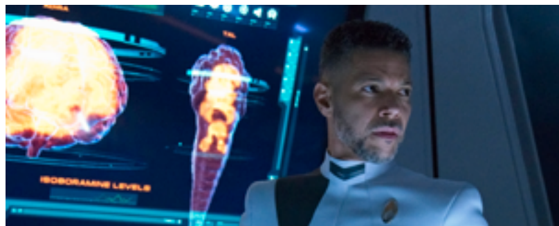
Wilson Cruz in STAR TREK: DISCOVERY