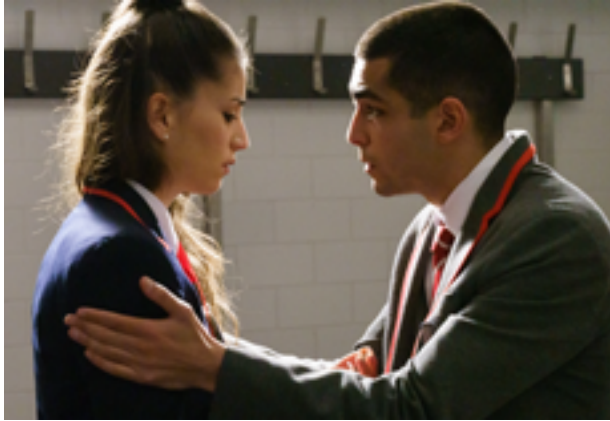
Claudia Salas and Omar Ayuso in ÉLITE