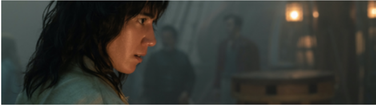
Vico Ortiz in OUR FLAG MEANS DEATH