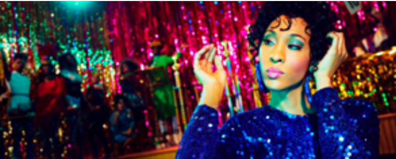
Michaela Jaé Rodríguez in POSE